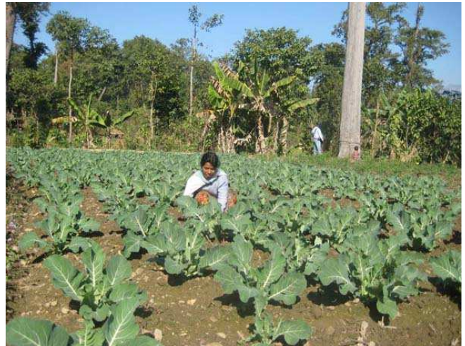
Farmers are supported with Seeds and Fertilizers