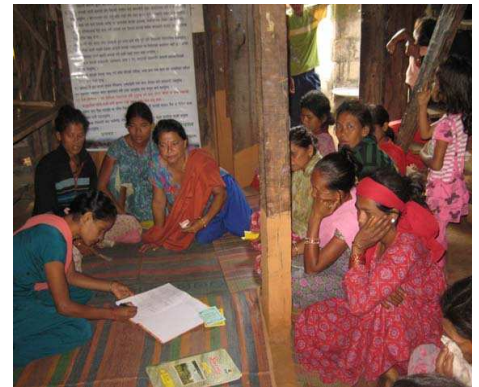
10 Women Saving Cooperatives has been a great place to promote Small Business and interactions to realize the hidden power of women for change.