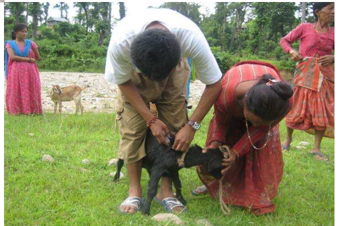
Women Groups were provided Goat Support for enhancing livelihood.