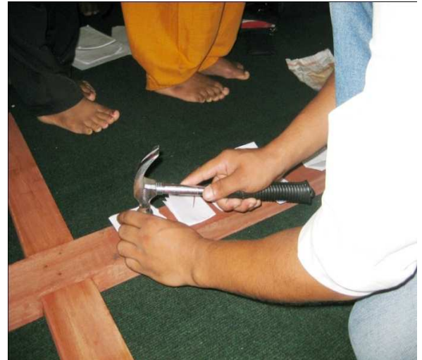
Participants nailing their grievances.

This program was conducted among high school's students in Churiya Mai VDC . The program theme was "The role of students in peace building".