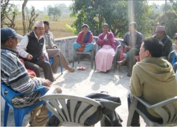
Field Visit and Monitoring.