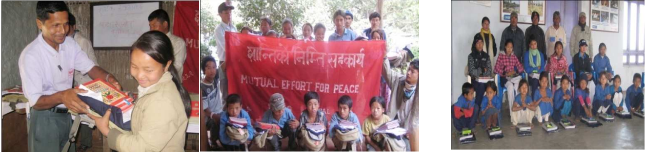
Victimized students receiving educational Support.

Peace is a program that supports victimized children from rural area. Students from Khotang and Makwanpur were supported.