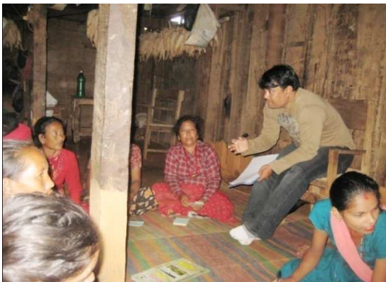
ETSC-N Staff coaching the monthly meeting.

Most marginalized and the needy people were given the resource to mobilize group and income generation.