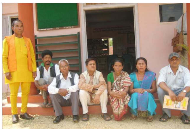
ETSC-N representative discussion with peace group.