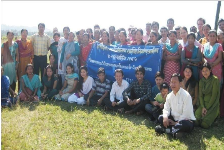
Participants of Forgiveness and Reconciliation workshop.

Course materials aim is to provide solid foundation of Biblical theology to raise awareness on peace and its practices in individual and community level for peace building. Forgiveness and reconciliation workshop helps people identify grievances in personal life. Workshop was held 5 times and 175 participants participated in the training.