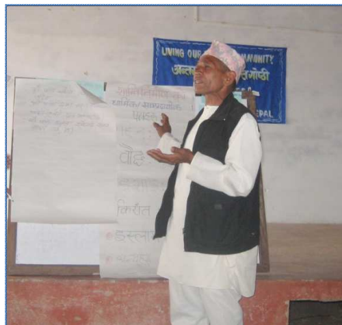
Sharing experiences on Interfaith Peace Building.