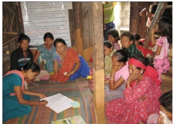
Group Meeting During Fund Release.