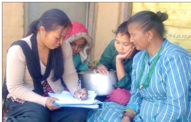
ETSC-N Volunteer on Household Survey.