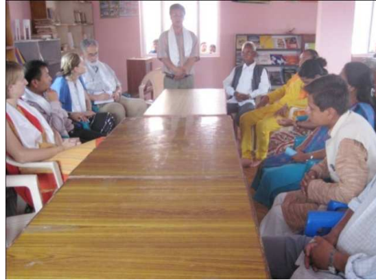
Stake Holders Meeting.